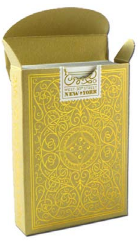
Classic Gold Deck by The Expert Playing Card Company (2015)

Playing Cards prefer a 68° F (20° C) and a relative humidity range of 30% - 40%. They can be stored in temperatures as low as 30° - 40° F (-1° through 4° C), as long as the humidity stays constant between 30-40%. For maximum longevity, a consistently dark, dry, and cool area is the best place to store cards. Dehumidifiers can reduce the moisture in a room or storage area and are inexpensive.